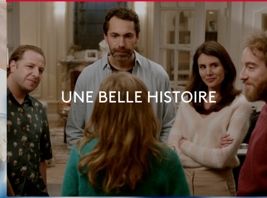
UNE BELLE HISTOIRE