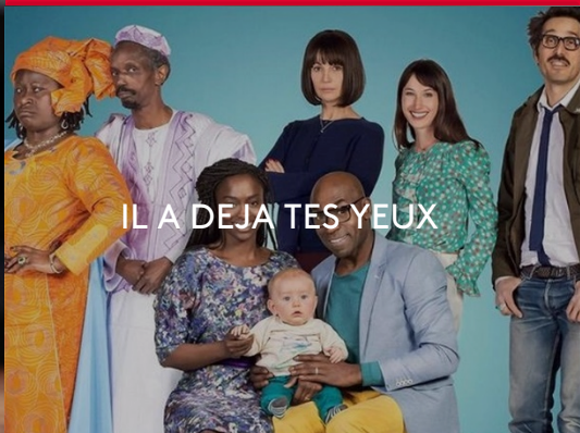
IL A DÉJÀ TES YEUX